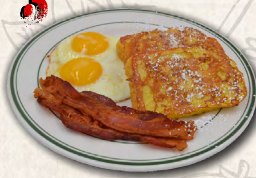
1 1/2 slices of sourdough french toast, 2 eggs & 2 strips of bacon 11.99