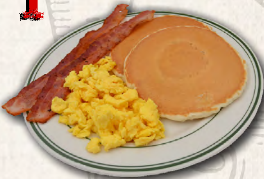
2 eggs, 2 pancakes or a waffle, 2 strips of bacon or 1 sausage link 10.99