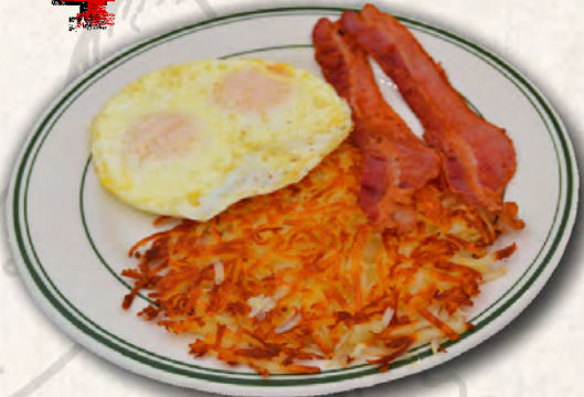
2 eggs, hash browns, 2 strips of bacon & your choice of fresh fruit or toast 11.99