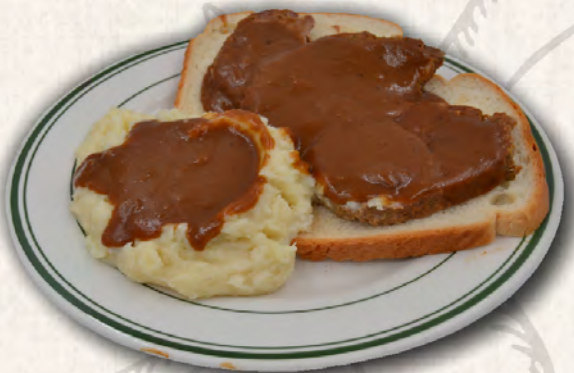
HOMEMADE MEATLOAF 13.99