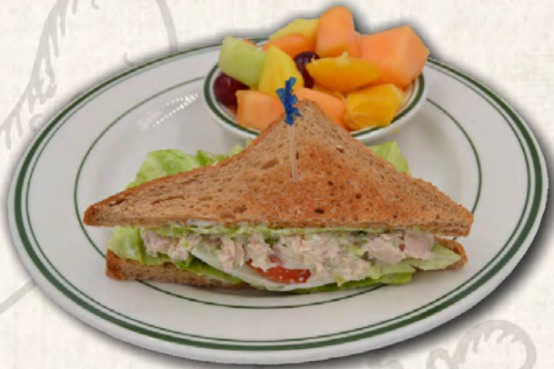
TUNA SALAD 11.49

Served with a bowl of homemade soup (after 11am) or crisp salad and a choice of french fries, onion rings, zucchini, cole slaw, or fresh fruit salad. Add an extra homemade soup (after 11am) or crisp salad for only 3.29 Add avocado for only 2.59