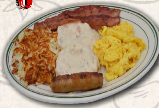
2 eggs, 1 sausage link, 2 strips of bacon, hash browns & buttermilk biscuit with gravy 15.99