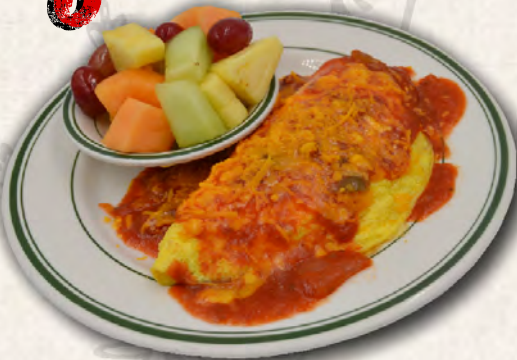
3 egg omelet, spanish sauce, cheddar cheese hash browns & toast 14.99